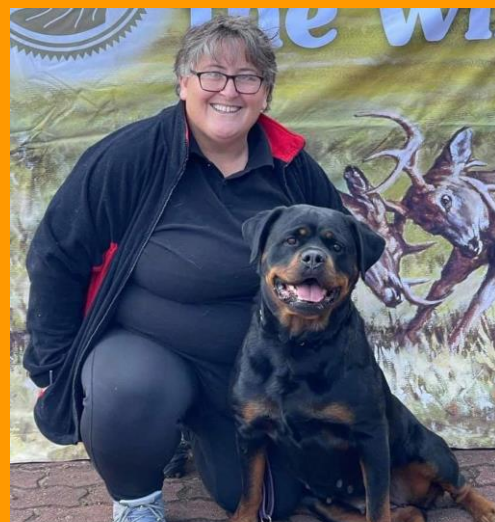
Ch Zempahphi You Never Know TSD "Cricket"