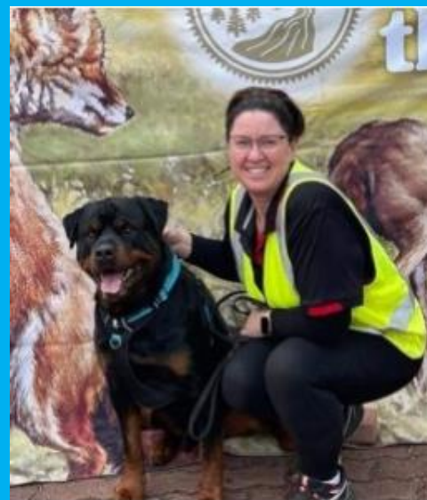
Ch Alchemy Chumpy Pullin (AI) TSDX "Bohdan"

Track 10 TSGrCh German Shepherd Dog Handler: Fran Gollan Juno passed with a Pass rating.