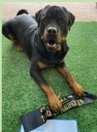
Kanberchic Broley Emperors JNR (AI) "Junior"