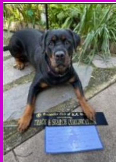
T Ch Blakesims Kanyemba Brooklyn (AI) RN TSD HSAs "Brooklyn"