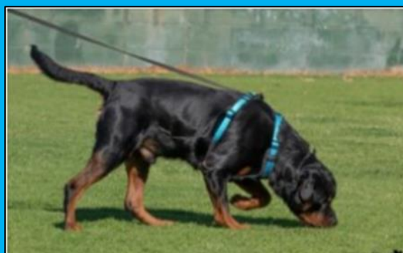
Ch Alchemy Chumpy Pullin (AI) TSD "Bohdan"